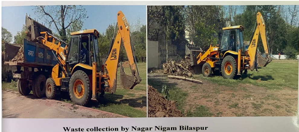
Waste collection by Nagar Nigam Bilaspur